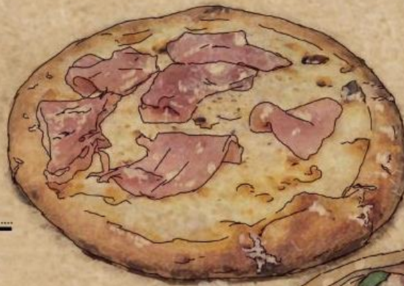
formaggio & margherita